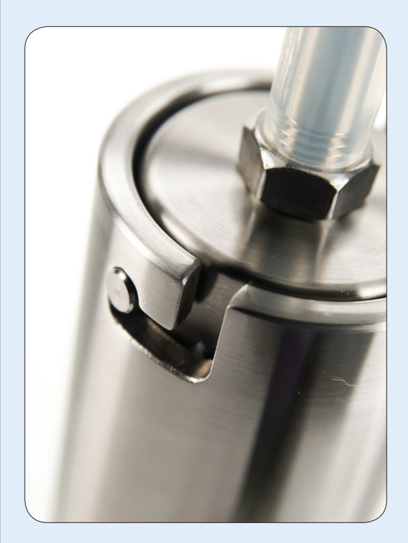
Quick-release bayonet connection for the head to bowl